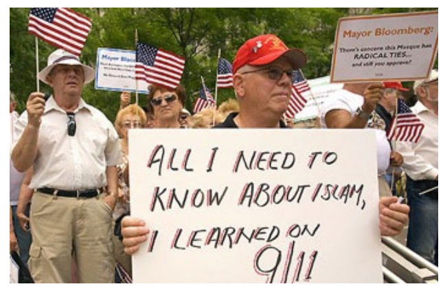
Hate crimes against Muslims are at their highest levels since 2001. The most recent FBI data indicates that from 2009 to 2010, hate crimes against Muslims in the United States soared by a staggering 42 percent.

People also talked about ethnic, religious, class and political differences that made South Asian identity challenging. "As a Pakistani, what does that even mean?" asked one person. "There are not a lot of Pakistanis out there in the U.S. You will find more Indian folks... So it's a choice I made (to identify as South Asian)... But also with all the stuff that's happened in Pakistan, I've gone back to thinking, I don't know if it's necessarily the best thing, because there's so much Islamophobia within the Indian community... It's a little bit back and forth... depending on... what you are trying to achieve... Does it make sense to build solidarity? Where does it make sense to want to represent your own community."