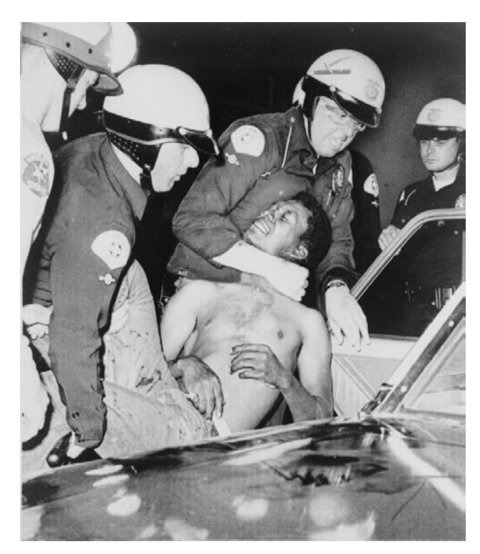
Arrest during the Watts Rebellion in 1965. Over the span of six days, Black residents frustrated with long-standing police brutality faced off against hundreds of L.A. police officers and 16,000 National Guard members.

Today, the "tough on crime" approach has ensnared other communities of color with its ever-expanding net – using language like "illegal immigrants," "criminal aliens," and "terrorists." The expanded ability of the state to arrest, imprison, deport, and kill peoples of color within and beyond U.S. borders lies in the manipulation of racialized ideas, and is rooted in the criminalization of Blackness.