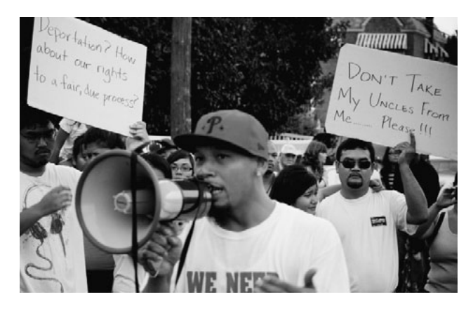
Cambodian refugees in Philadelphia protest unjust deportations. In 1996, President Clinton enacted a new immigration law that vastly expanded the definition of deportable "criminal aliens", made the definition retroactive, and eliminated judicial review. Since then, hundreds of young Cambodian men who entered the U.S. as small children fleeing the Khmer Rouge have been deported.

In addition to first-generation immigrants,