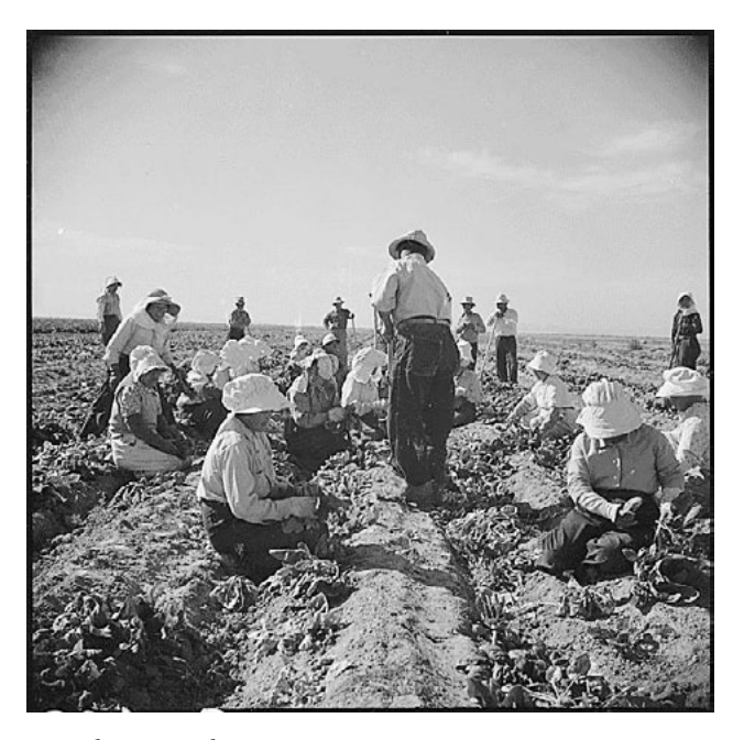
The Gila River Relocation Center was a 15,000 acre internment camp that opened on the Gila River Indian Reservation in Arizona in 1942, against the wishes of the local Native American community. The camp held over 13,000 Japanese American inmates, most of whom were from California.

Linkages between Native Americans and Pacific Islanders came up a few times, although many of these responses also acknowledged that Pacific Islanders were so often overlooked