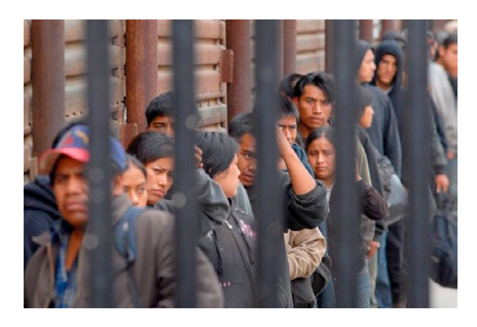
In San Diego, undocumented immigrants await deportation to Mexico. The number of immigrants deported by the United States doubled between 2001 and 2011, to almost 400,000 in fiscal 2012.

For those who do tackle race explicitly, the sheer enormity of structural racism obscures what racial justice strategies should entail. One movement leader asked, "Is a win getting racial equity impact statements passed with legislation? Is a win changing the composition of leadership bodies so that they're more representative of people of color...? When we start looking at race from a more structural lens, what it takes to win becomes much bigger... I think it's complicated."