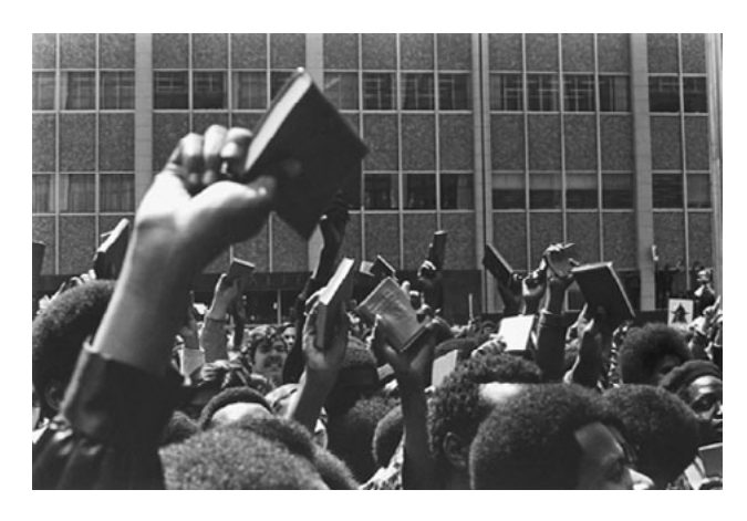
Black Panther supporters hold up Mao's Red Book, Oakland 1969.

Among Asian American participants, when asked how they got involved in racial justice work and where their race politics came from, by far the strongest theme was college. Fully 60% of participants said that college was critical in the development of their race analysis. The only real demographic difference was that U.S.-born people were more likely to follow the college model than immigrants (67% versus 46%). Notably, only two people in the entire study – both Asian American – reported that they didn't have a Bachelor's degree. One said he got politicized in