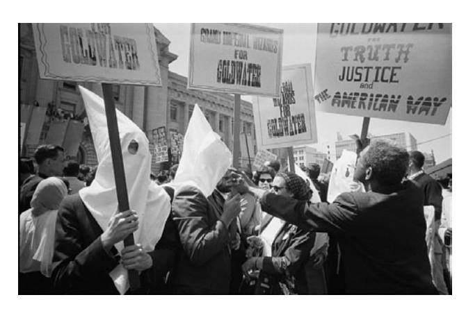
Ku Klux Klan members supporting Barry Goldwater's campaign for the presidential nomination at the Republican National Convention, San Francisco, California, as an African American man pushes signs back: 12 July 1964.

Just as neoliberalism was a backlash against the post-WWII decline of the 1%, the rise of the modern political right was a backlash against the Civil Rights Movement. Understanding the ascendancy of the right over the last 40 years reveals how racial politics have shaped current economic, social and political conditions.