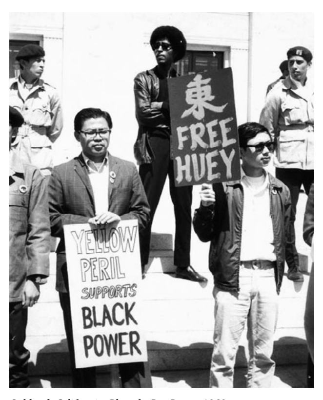
Oakland, California.

Another person said that there should be greater investment in teaching younger people about race. "I actually sometimes find that the older generations [who have] been through the Civil Rights Movement, for example, still get it... [They] still know that the struggle's not over," she said. "For younger generation folks, there's just not as many opportunities... It's not so much about generation as it is just who has had access to opportunities to talk about racial justice... Nobody funds that work anymore."