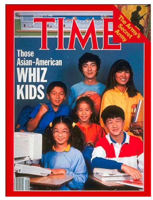
This Aug. 31, 1987 cover of Time magazine reflects the endurance of the model minority myth, which first emerged in 1966.

Some felt that those Asian Americans who were the most race-conscious tended to be low-wage workers who do not fit into the model minority stereotype. "So Indian and Pakistani taxi drivers in New York, Asian guest workers... hotel and service industry workers, I think that their worker centers and unions, as well as their workplaces offer real opportunities for solidarity between themselves and Latinos and African Americans," said one organizer. "Their workplaces really clearly show the racial hierarchy of this country... Low-wage workers, have, I would say, the highest consciousness about race."